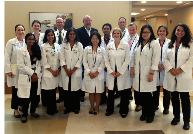
Atlantic Health System Teams